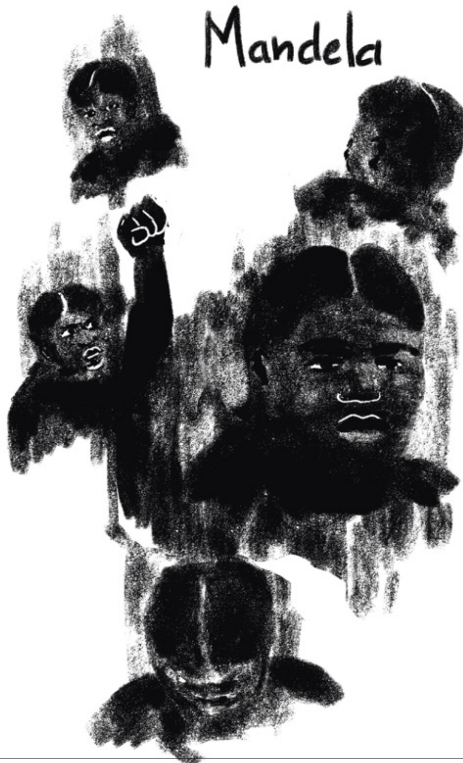
Character study (drawing : OERD)

things. The commission was quite complex. Oerd had to design something extraordinary on the screen without it eclipsing the sound. Oerd's work has humour and some amusing artistic ideas. It was important to make the most of the lighter moments in the film. It needed some breathing space. In short, Oerd ticked all the boxes and added his idiosyncrasies. South African politics - which separated people on the basis of their skin colour - lends itself to the design. Black, white and a line between them. There wasn't a doubt that Oerd would come up with something wonderful.