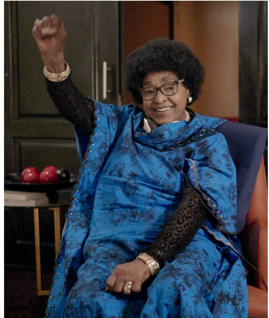
Winnie MANDELA – December 2017