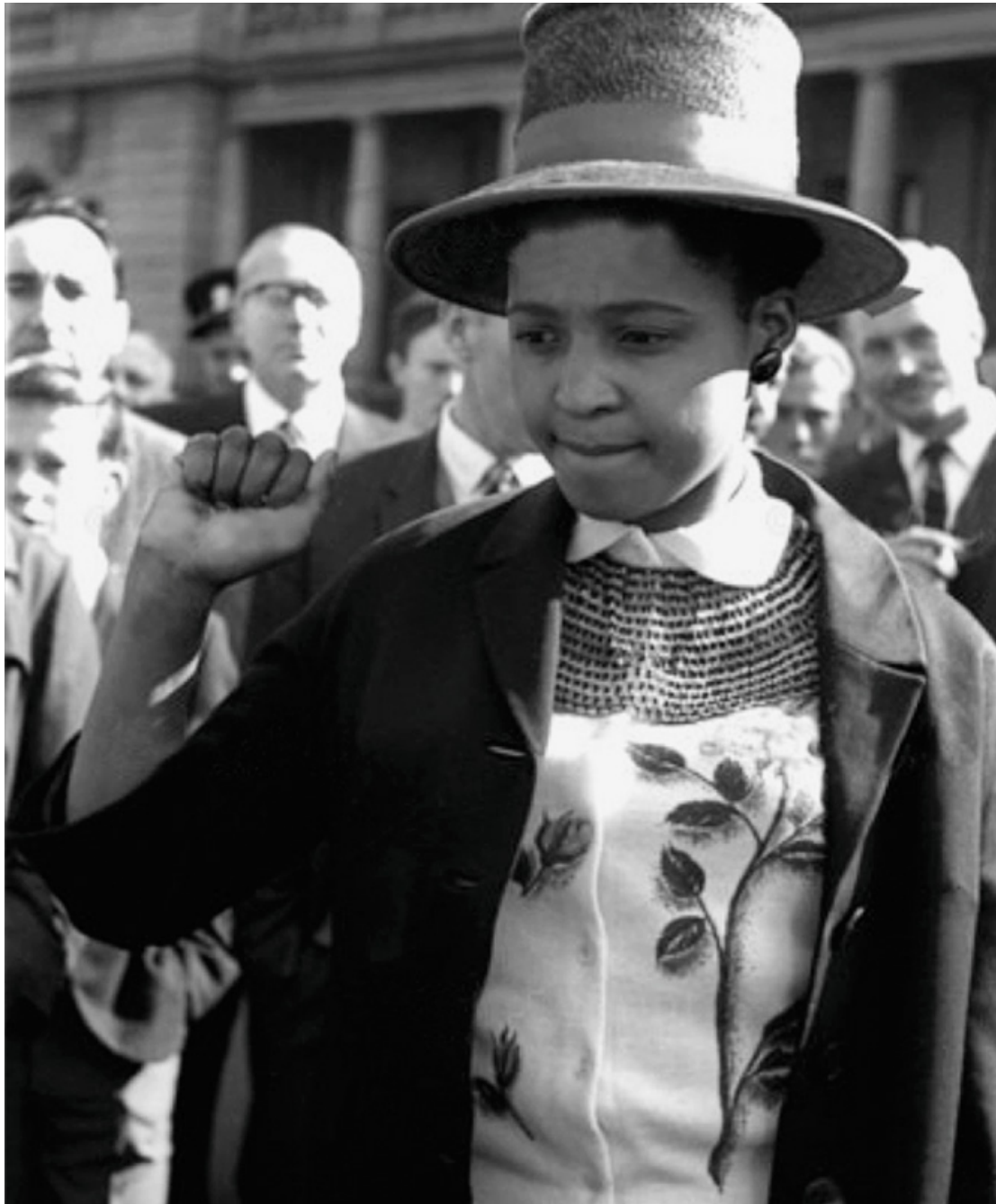
Winnie MANDELA – 1964