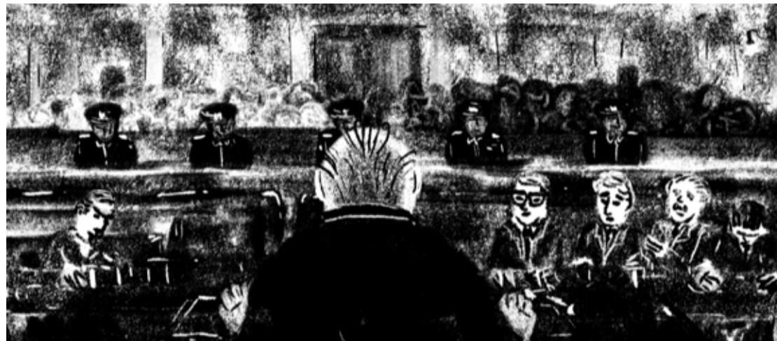
Drawing : OERD

What was your reaction when Gilles Porte contacted you about the film ?