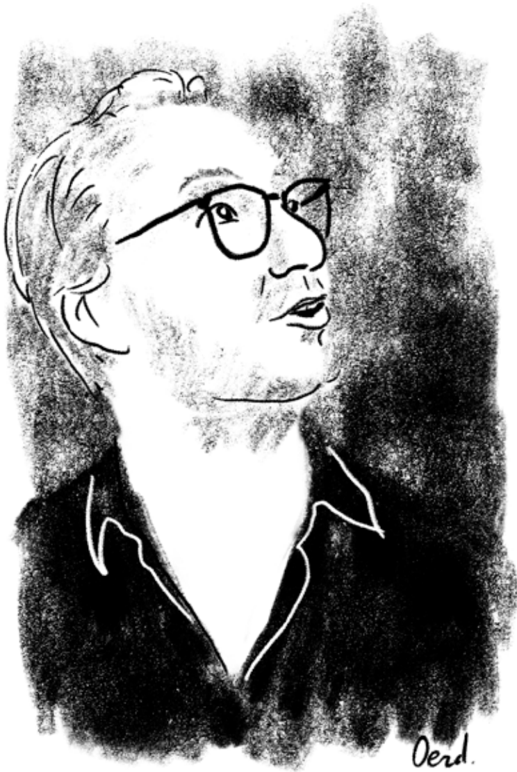
Drawing : OERD

Champeaux was born into a Franco-American household in 1975.