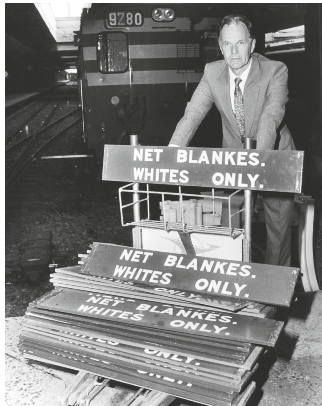
South Africa – 1960s

N.C. That's right and in fact the apartheid government shot itself in the foot. One of the main planks of apartheid had been